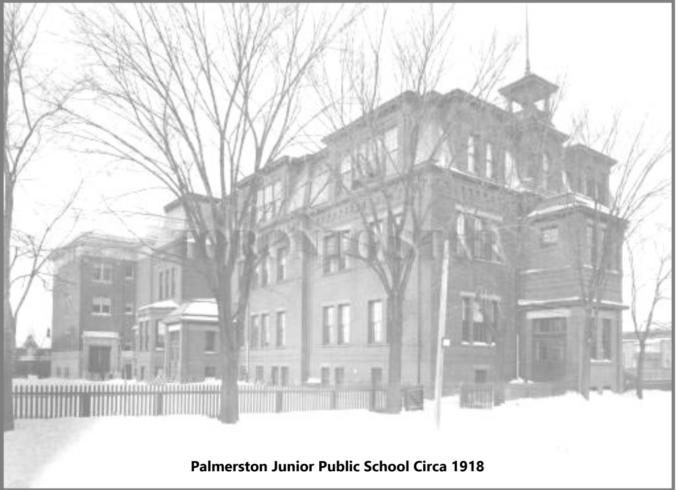
Palmerston Junior Public School Circa 1918